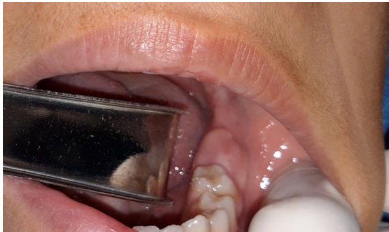
Figure 1. Intraoral view indicating a cystic lesion located on the region of the left second mandibular molar

An 11-year-old male patient was referred to the dental clinic at Babol University of Medical Sciences in December 2018. The chief complaint was a swelling on his left posterior mandibular ridge for 6 months that interfered with his chewing. There was no history of pain or paresthesias. Intraoral examination revealed a swelling in the region of the unerupted left mandibular second molar that interfered with its eruption. The lesion had a smooth surface with normal color, and there was no erythema or ulceration (fig.1).