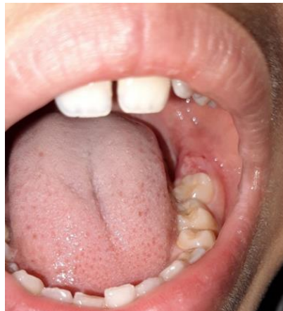
Figure 4. Intraoral view after 6 months indicating full eruption of the second molar